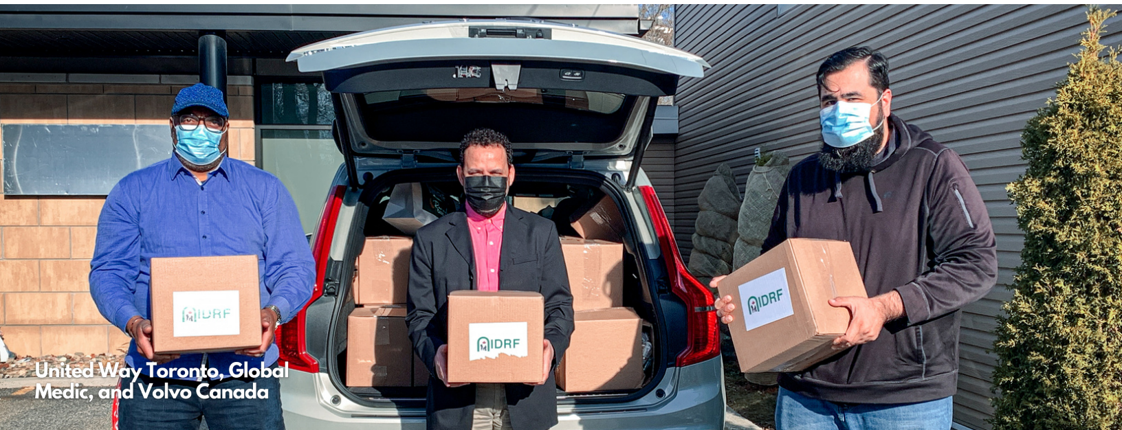
United Way Toronto, Global Medic, and Volvo Canada

We packed and delivered 4,000 food boxes full of lentils, rice, and non-perishables to families in need in the GTA, Vancouver, Calgary, Edmonton, Ottawa, Quebec City and Montreal regions.